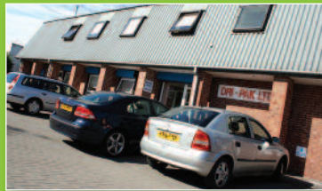
Our offices based at Furnace Road, Ilkeston.

We welcome feedback from our customers, so please get in touch.